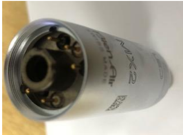
Bien Air Electric Motor

Three other connectors for air turbine handpieces are available on the unit – two for high speed handpieces and one for a low speed handpiece. Connections are a standard 2-hole 4 pin connection. Your handpiece must be equipped with a self contained fiber optic light system or you must provide your own adapter.