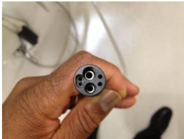
Connector for Air Turbine Handpiece

Three other connectors for air turbine handpieces are available on the unit – two for high speed handpieces and one for a low speed handpiece. Connections are a standard 2-hole 4 pin connection. Your handpiece must be equipped with a self contained fiber optic light system or you must provide your own adapter.