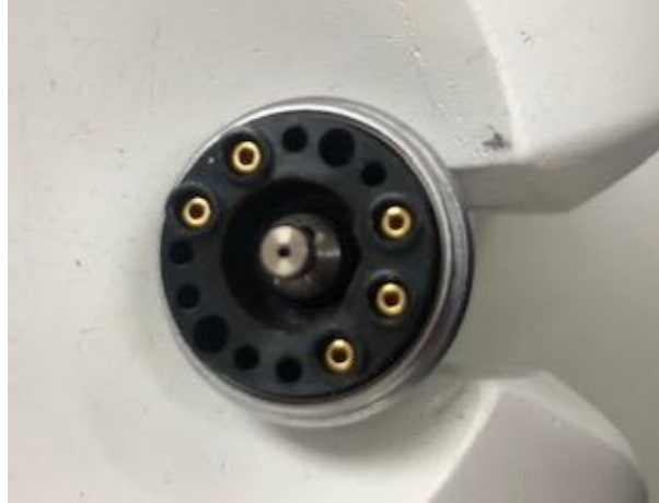
Bien Air Electric Motor Connector